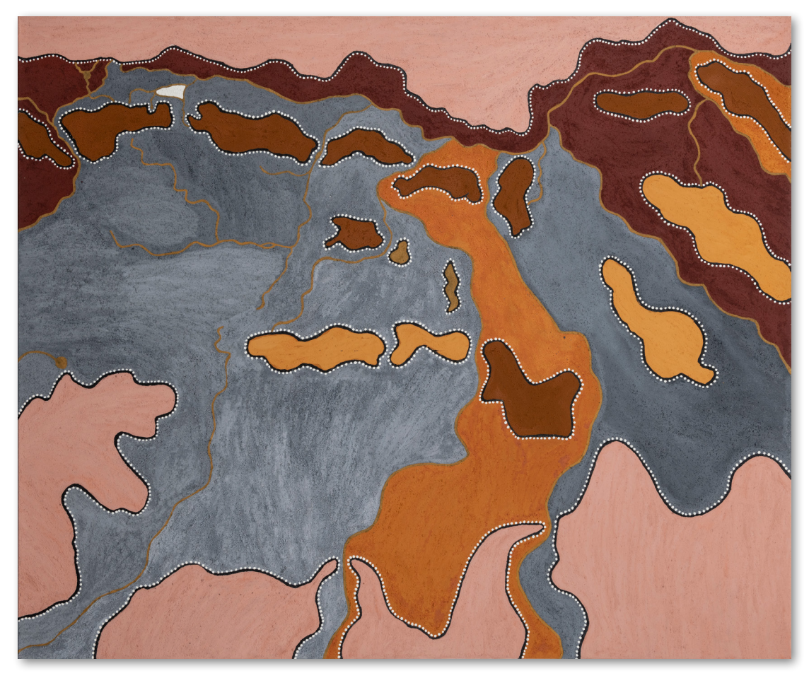
Lindsay Malay. 'Little Fitzroy river Catchment' 150 x 180cm, natural earth pigments on canvas, 2018. £3,000

'In this altered time, our gaze has been turned inwards to our immediate environment. Staring at this restricted view we can begin to see more clearly and we are reminded to be grateful for the smallest of things. We can witness the miracle of each moment; feel the everyday sublime. Meanwhile, our minds transport us to our internal world of memories, hopes and dreams, and keep us rooted in our beliefs'